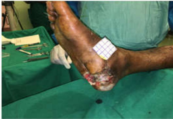
Fig. 1: Showing step 1

Step 1: Wounds to be photographed after placing the square grid next to the wound.