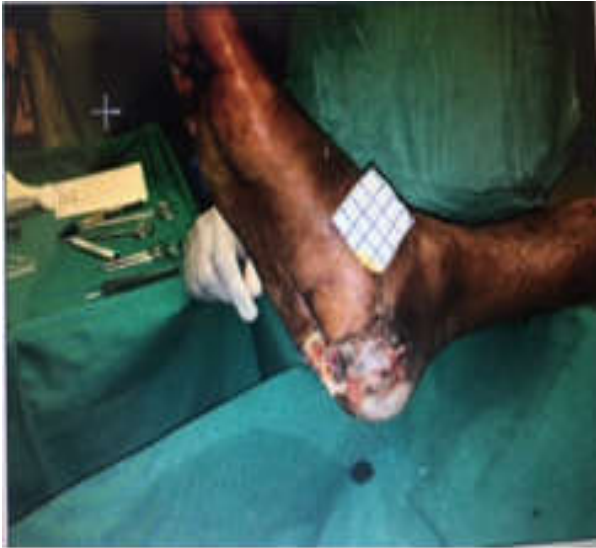
Fig. 7: Showing details about step 7