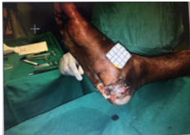
Fig. 6: Details about step 6.

Step 6: The wound edges marked with the free hand selection, analysed and labelled in a similar manner.