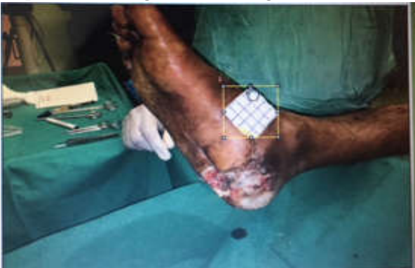
Fig. 3: Showing details of step 3

Step 4: Select Plugins-Analyse-Measure and set