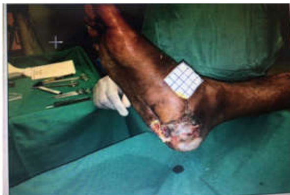
Fig. 2: Showing details of step 2

Step 2: Open the image using Image-J™ Software